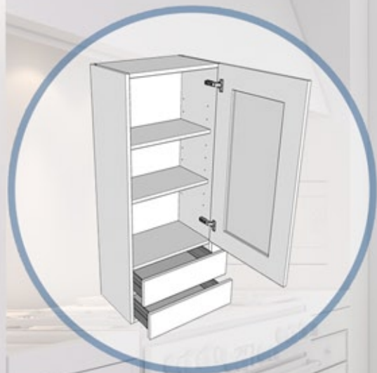
WORKTOP MOUNTED DRESSER UNIT WITH DRAWERS AND DOOR