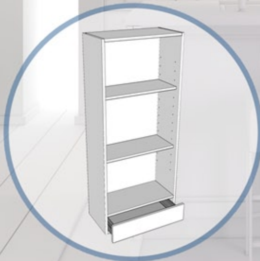
WORKTOP MOUNTED DRESSER UNIT WITH DRAWER